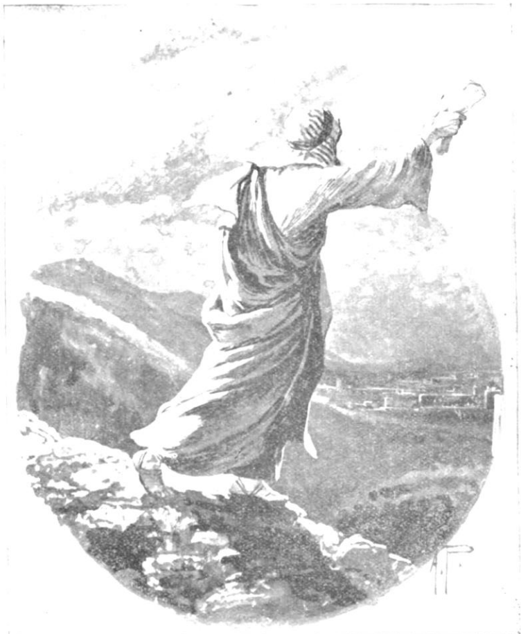
“How beautiful upon the mountains are the feet of him that bringeth good tidings.”— Isa. lii. 7.